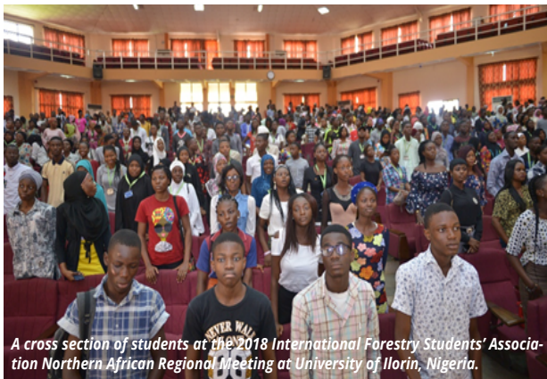
A cross section of students at the 2018 International Forestry Students' Association Northern African Regional Meeting at University of Ilorin, Nigeria.

The project is a collaboration by the International Union of Forest Research Organizations (IUFRO), International Forestry Students' Association (IFSA) and the joint IUFRO-IFSA Taskforce on Forest Education. This project aims at motivating and inspiring African youth to pursue forest-related studies and careers by increasing the visibility of career options, networking opportunities and young African role models working in forest-related fields. The project was launched in May 2020 and will run up to December 2020. Support for this project has been provided by IUFRO's Special Programme for Development of Capacities (IUFRO-SPDC) and the Joint IUFRO-IFSA Task Force on Forest Education.